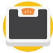
WEIGHT LOSS PROGRAM

Osteoarthritis can turn everyday activities into huge challenges. Dealing with pain may be as simple as modifying your activities. If an action causes pain, avoid it. Here are some other steps that may be effective in dealing with joint pain: