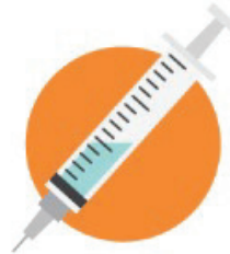
INJECTIONS INTO THE AFFECTED JOINT